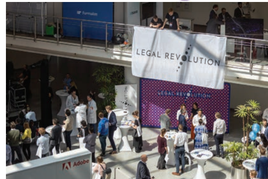
Legal Revolution 2024