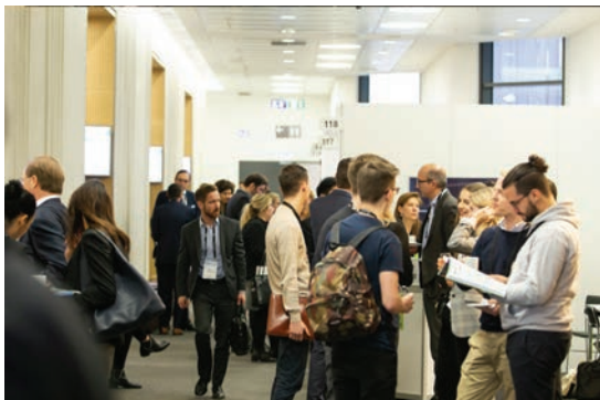
Legal Revolution 2019