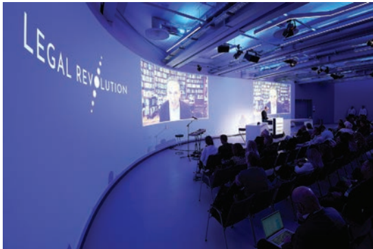
Legal Revolution 2025