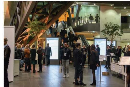
Legal Revolution 2018