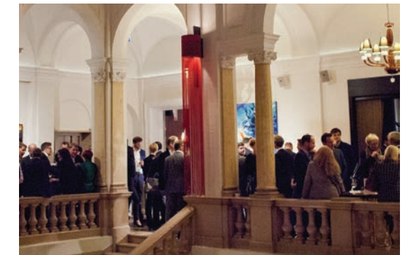
Legal Revolution 2017